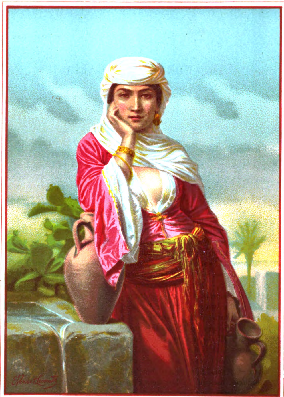
E. VERNET LECOMTE PINX.